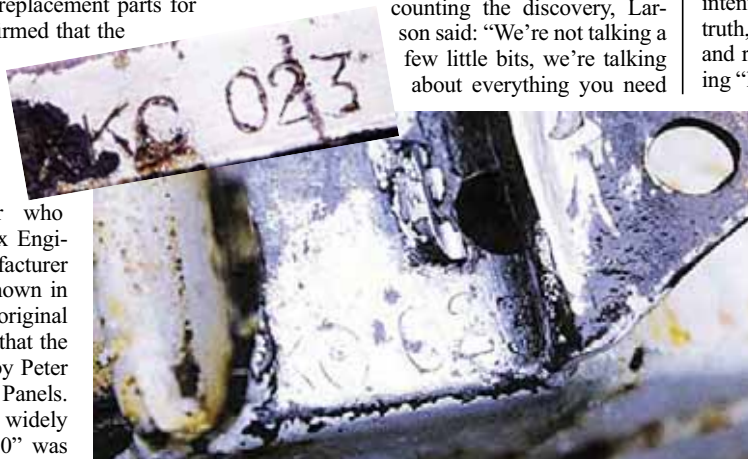
Revealed under the weld: Positive proof of identity.