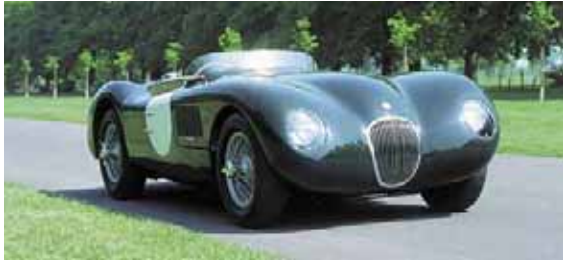
Early 1980s: Peter Jaye builds replica C-type

1994: "TGH 210" runs in Mille Miglia again