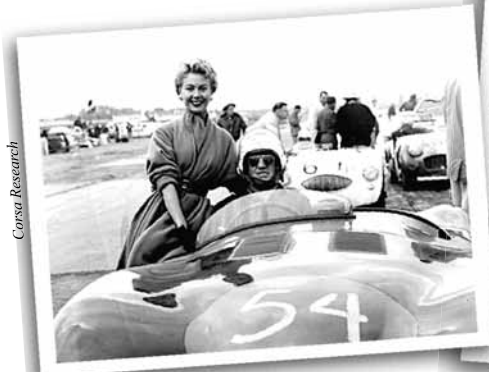
Mitzi Gaynor and Jack Douglas at Torrey Pines.

The car was offered for sale as XKC 023 at the Essen Classic Car Show in the mid-1990s, when a prospective buyer who was suspicious of its origins sent some photographs of the car, including a copy of its 1950s-style British logbook, to C-