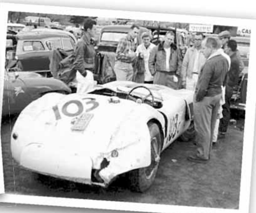
The C-type after being rolled in November 1956.