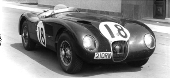
1970s: Schierenbeck dismantles XKC 023

November 18, 1956: Ces Critchlow rolls XKC 023 in race at Paramount Ranch, CA