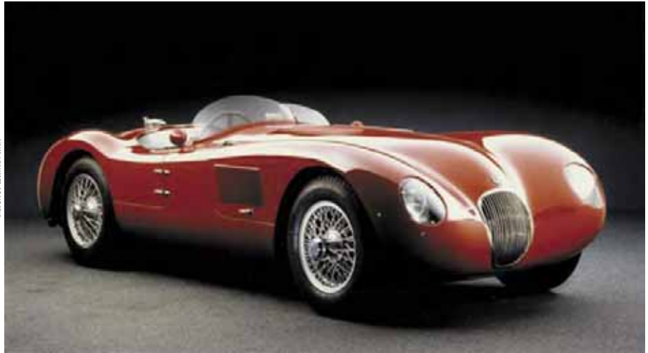
Once completely dismantled, XKC 023 was brought back to life.

Sometime after the crash, XKC 023 suffered the indignity of having its twice-damaged alloy body removed. It was replaced by an ill-fitting fiberglass Devin body at Horvath Motors in